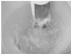
Aerate water for one hour to drive off chlorine.

Unlike the tea that is served with crumpets, compost tea is not steeped in hot water until the color of the water darkens. Cool to tepid, non-chlorinated, and highly oxygenated water is used. Chlorine kills microorganisms and is commonly used in municipal water systems. If chlorinated water must be used, it should be aerated with the brewer's air pump for one hour before brewing tea.