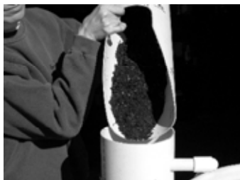
Pour compost and nutrients into the top of the brewer.

LOADING AND BREWING: Add nutrients and compost (see recipes) to the top of the brewer. Use 65 - 80° F water. Microbes grow too slowly in cold water and won't like it much over 80° either. Brew for 18 to 24 hours. After 18 hours, the bacterial content of the tea may increase while the fungal content may decrease. Brewing longer than 24 hours may reduce dissolved oxygen levels to below acceptable levels. If only cold water (55 - 65°) is available, brew for 30 to 36 hours or use a tank heater to warm the water. If water is warmer than ideal (75 - 85°) 18 hour brew time may be appropriate. Allowing the brewer to continue operating beyond prescribed time period may alter the microbe content.