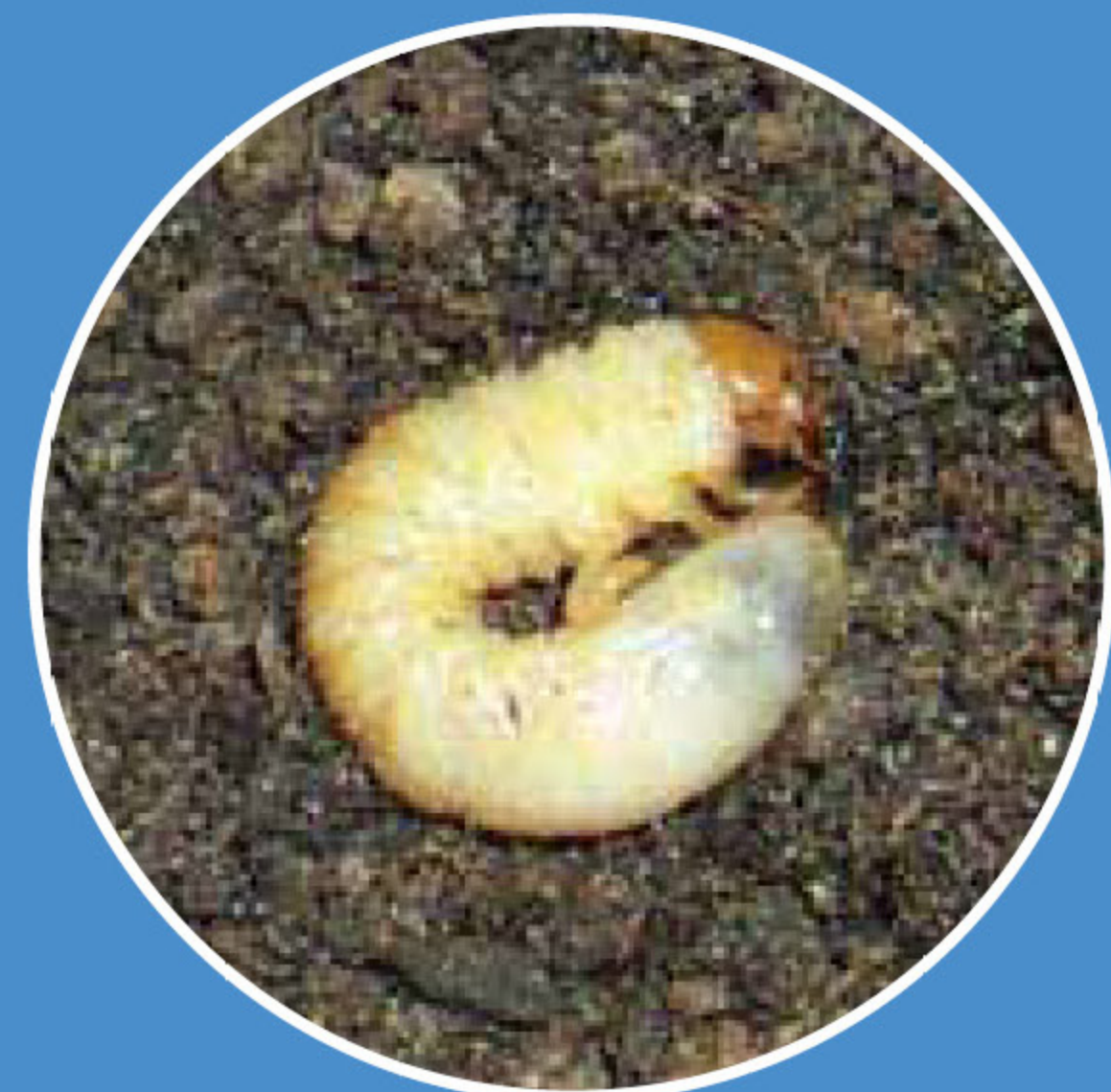
Grub infected with Milky Spore